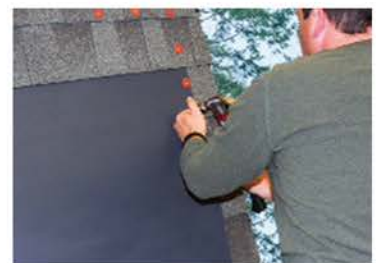
SIMPLY ATTACH WITH ROOFING NAILS