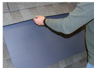
EASY AND QUICK TO INSTALL